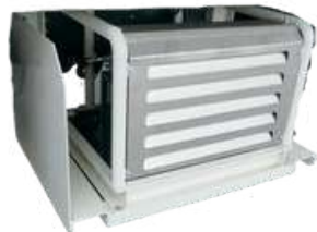
Tamrotor Hydraulic Powered Compressors