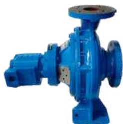
Hydraulic Water Pumps