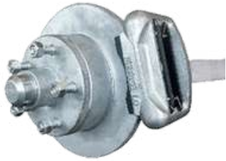
Axles and Brakes