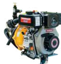
Diesel Powered Pumps