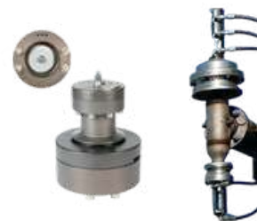
Ground Speed Control Systems