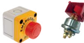
Mine Spec Accessories