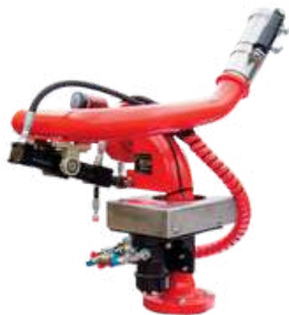
Hydraulic Actuated Water Canons