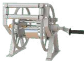
Manual Rewind Hose Reels