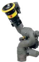
Electric Actuated Water Canons