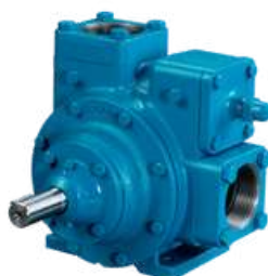
Hydraulic Powered Fuel Pumps