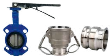
Valves and Accessories