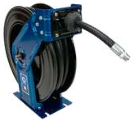
Graco Hose Reels