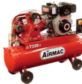
Airmac T20D Compressors