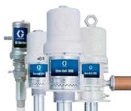
Graco Stub Pumps