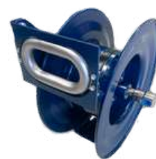
Cooper Hydraulic and Pneumatic Hose Reels