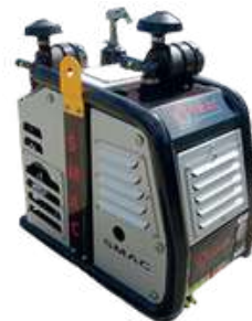
SMAC Compressor/generator Units