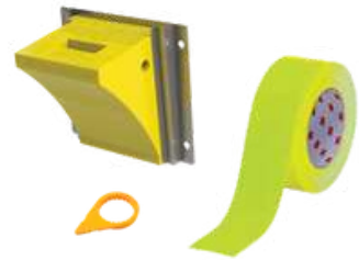
Mine Spec Accessories