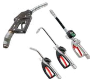
Nozzles and Meters