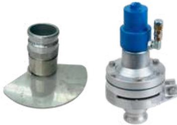
Pneumatic Spray Heads