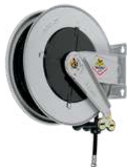
RAASM Hose Reels