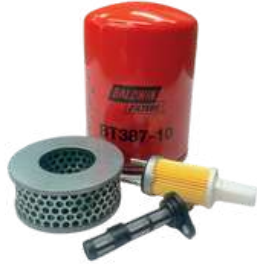
Filter Service Kit