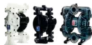
Graco Double Diaphragm Pumps