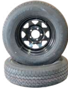
Rims & Tyres